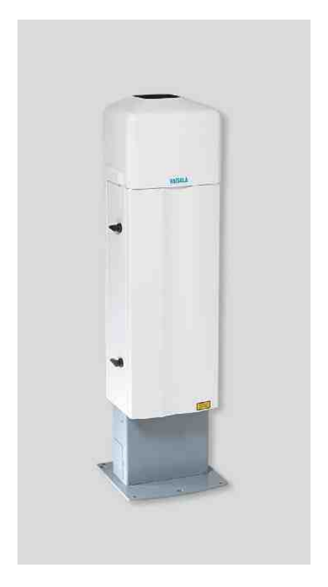
Vaisala Ceilometer CL31 measures cloud base height and vertical visibility in all weather - good or bad.

The CL31 is easy to install. It has a radiation shield that protects the unit during precipitation and against excessive heat or cooling in extreme temperatures. The automatic window blower with heater improves performance by keeping the window clean and dry. In cold conditions heating prevents frost generation on the window.