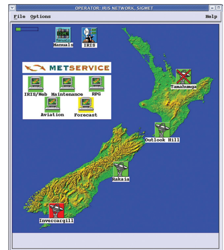
The IRISnet Network management tool lets you see at a glance the status of all radar & display systems. Operators can travel the network with a few clicks of their mouse.

The ingest files generated by the radar process are the starting point for the product generator. IRIS™ has the most comprehensive suite of products available in the industry today (see product summary page). The product configuration and product scheduler menus give operators full control over the details of the product generation and the mix of products for each operational mode. All products are made in the original polar coordinates of the radar data with correction for earth curvature and full interpolation. Resolution and map projection are selectable.