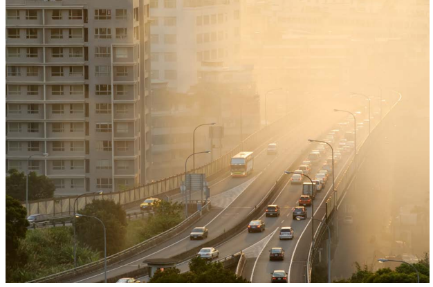
The PWD52 is well suited for meteorological and environmental observation networks.

Ihree programmable relay controls (open collector), visibility alarm threshold and delays configurable, fault alarm relay 0 ... 1 mA, 4 ... 20 mA analog current