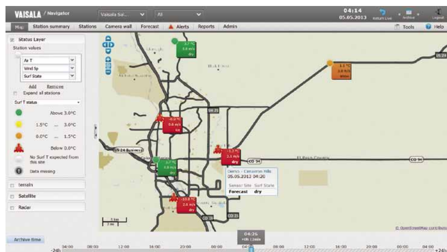
Map view of Vaisala RoadDSS Navigator

The Vaisala RoadDSS Navigator is a hosted web user interface for viewing past, present and future road weather data. The application displays data collected by the Vaisala Global Data Management Center, which handles data collection from the road weather networks around the world. The application consists of a set of dynamic web pages that can be viewed with a simple Internet connection. The Vaisala RoadDSS Navigator also features GIS maps which are optimized to clearly display road weather data, including Thermal Mapping and mobile weather observations, where available. The Navigator user interface is part of the Vaisala RoadDSS Software Suite and provides the added functionality of providing detailed reporting. The reports save you time in compiling information from the system making your job easier. Navigator also includes detailed alerting functionality that continuously monitors specific parameters you make decisions on, and then provides you with notification as soon as those